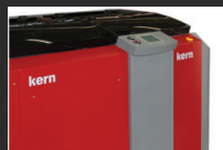
Roll-to-Cut K130 High Speed Rotary Cutting System