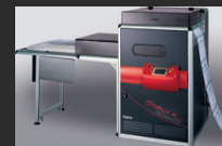
Roll-to-Fold K146 High Capacity Folding System